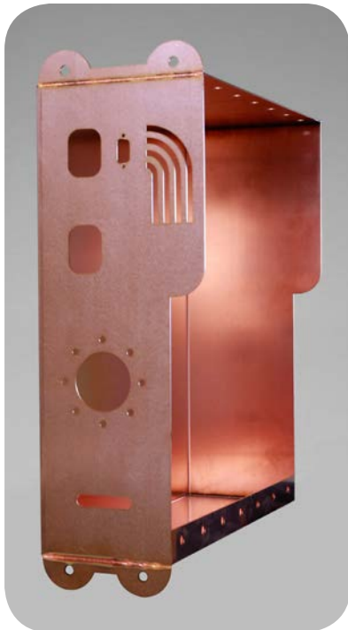
Chassis, electrolytic copper Combined punching and laser processing